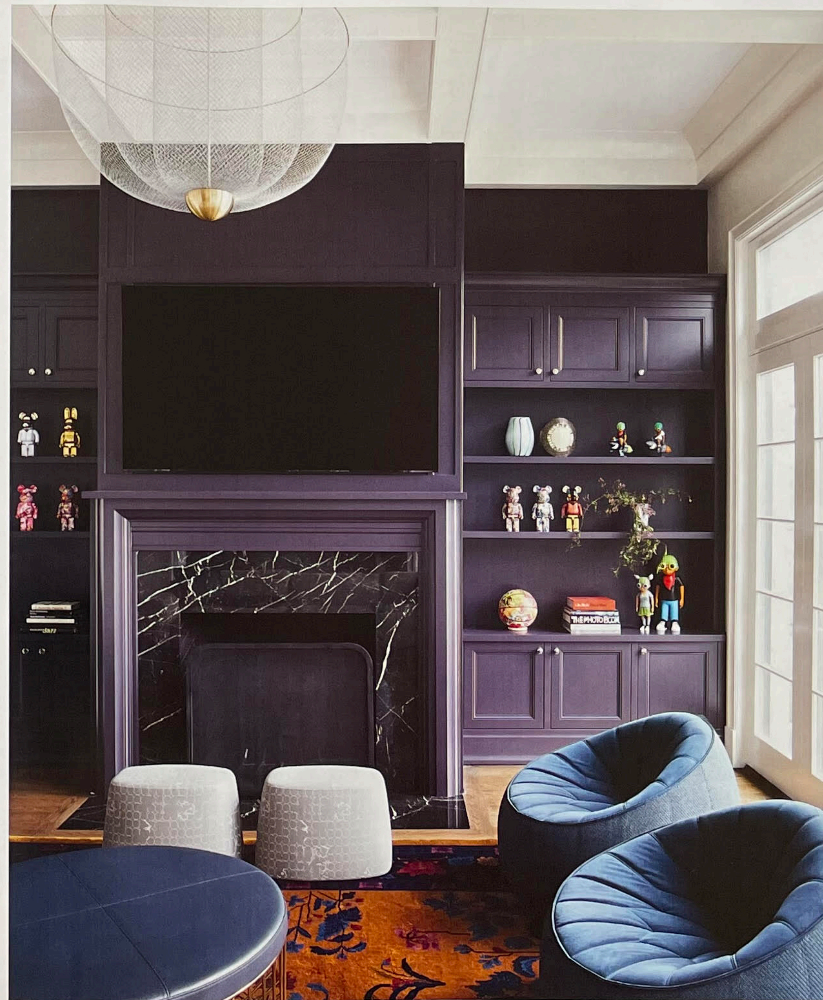
A sofa and a pair of chairs by Ligne Roset surround an ottoman by Phase Design from Haute Living in the colorful family room. The chandelier is by Moooi from Haute Living.