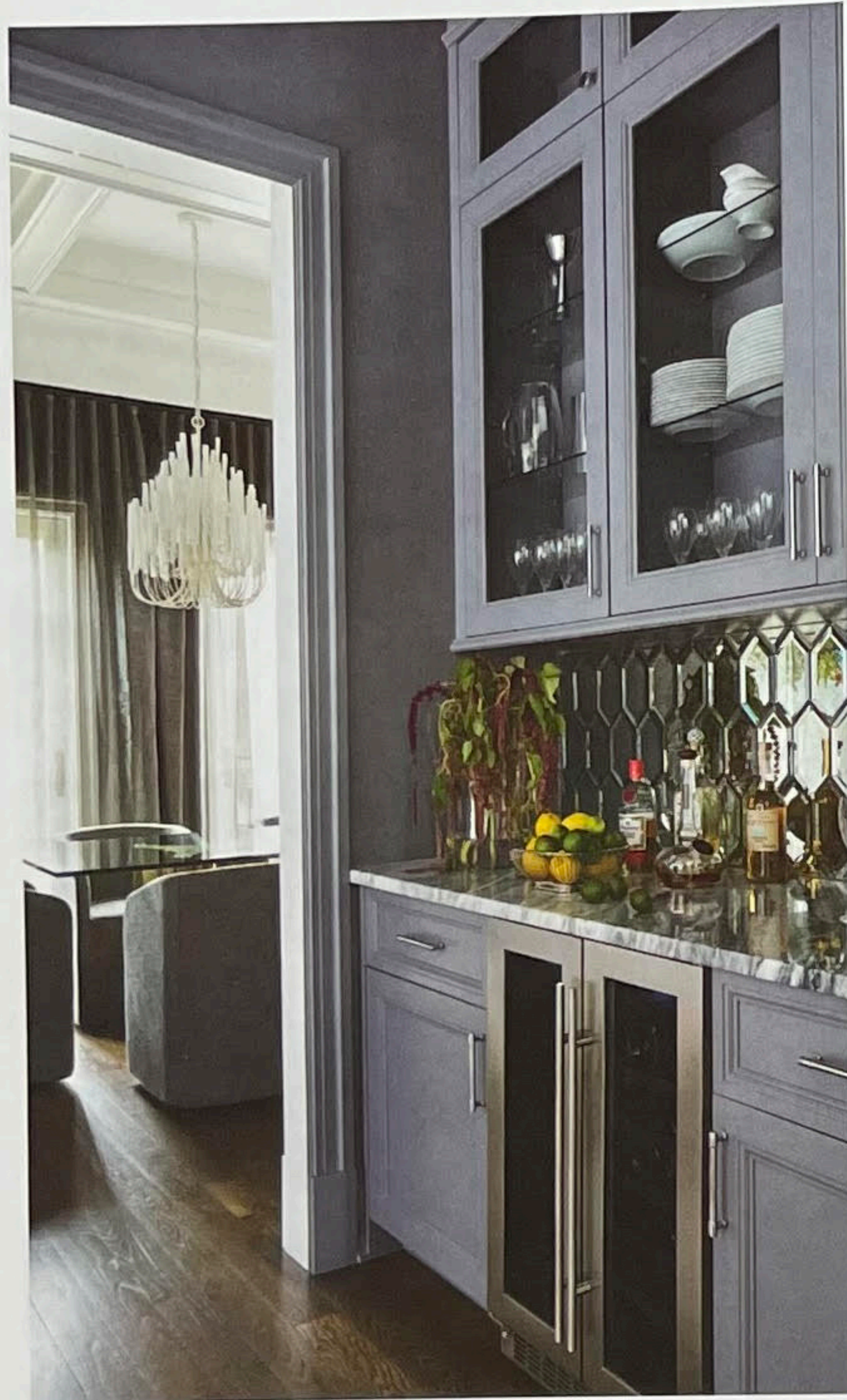
An antiqued mirror backsplash from TileBar adds a touch of glam to the butler's pantry, where the walls, ceiling, molding, cabinetry, and shelving are painted Periwinkle blue.

Kauffmann took the traditional house in a modern direction that better suited the couple's personality.