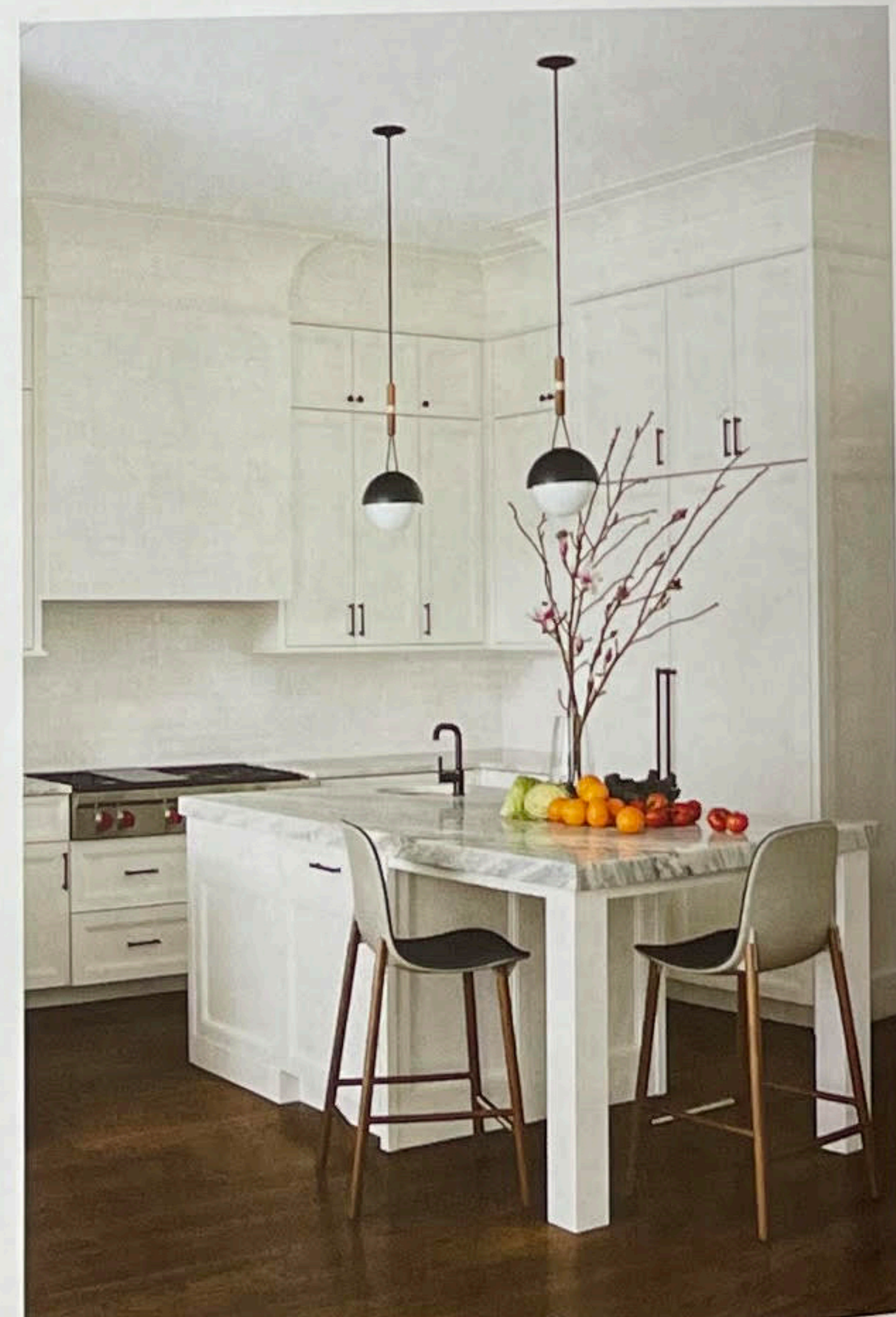
A pair of contemporary pendants by Allied Maker and black hardware from Kohler beautifully contrast the white cabinetry and backsplash from Bedrosians Tile & Stone in the updated kitchen.

Reimagining the built-in shelving surrounding the family room fireplace in a deep purple hue likewise fosters a modern milieu — a striking backdrop for the couple's growing collection of colorful Bearbrick and Flyboy pieces by Hebru Brantley. Adding to the sense of whimsy, Kauffmann paired it with a soft pink sofa and a pair of curvaceous blue slipper chairs atop a vintage rug with a rust background. "None of it makes sense, but it all makes sense," the wife jokes.