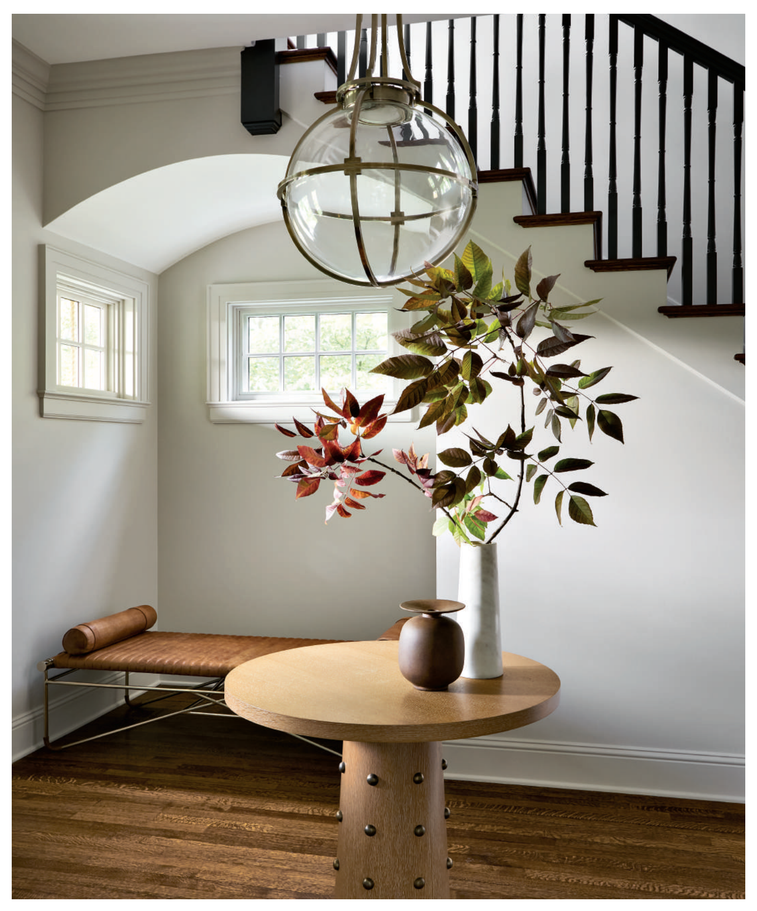
A Visual Comfort & Co. pendant and studded cerused-oak table by Barron Custom Furniture play off the architectural curves in the entry of this repoyated Victorian home. The saddle-leather bench is by CR2

In fact, there is hardly a space that isn't welcoming to guests. During a recent Italianthemed housewarming party, the owners cooked pizzas in the outdoor kitchen as their guests moved back and forth between the patio and the dessert bar in the formal dining room. "We built the house to share with others," the wife explains. But it's also a home that they enjoy on a more intimate, personal level. Living there, the wife says, has changed her outlook on life. "I'm focusing more on joyful moments," she notes, recalling the way the mid-afternoon sunlight reflects off the dining room chandelier's gold petals. "This home takes my breath away." ■