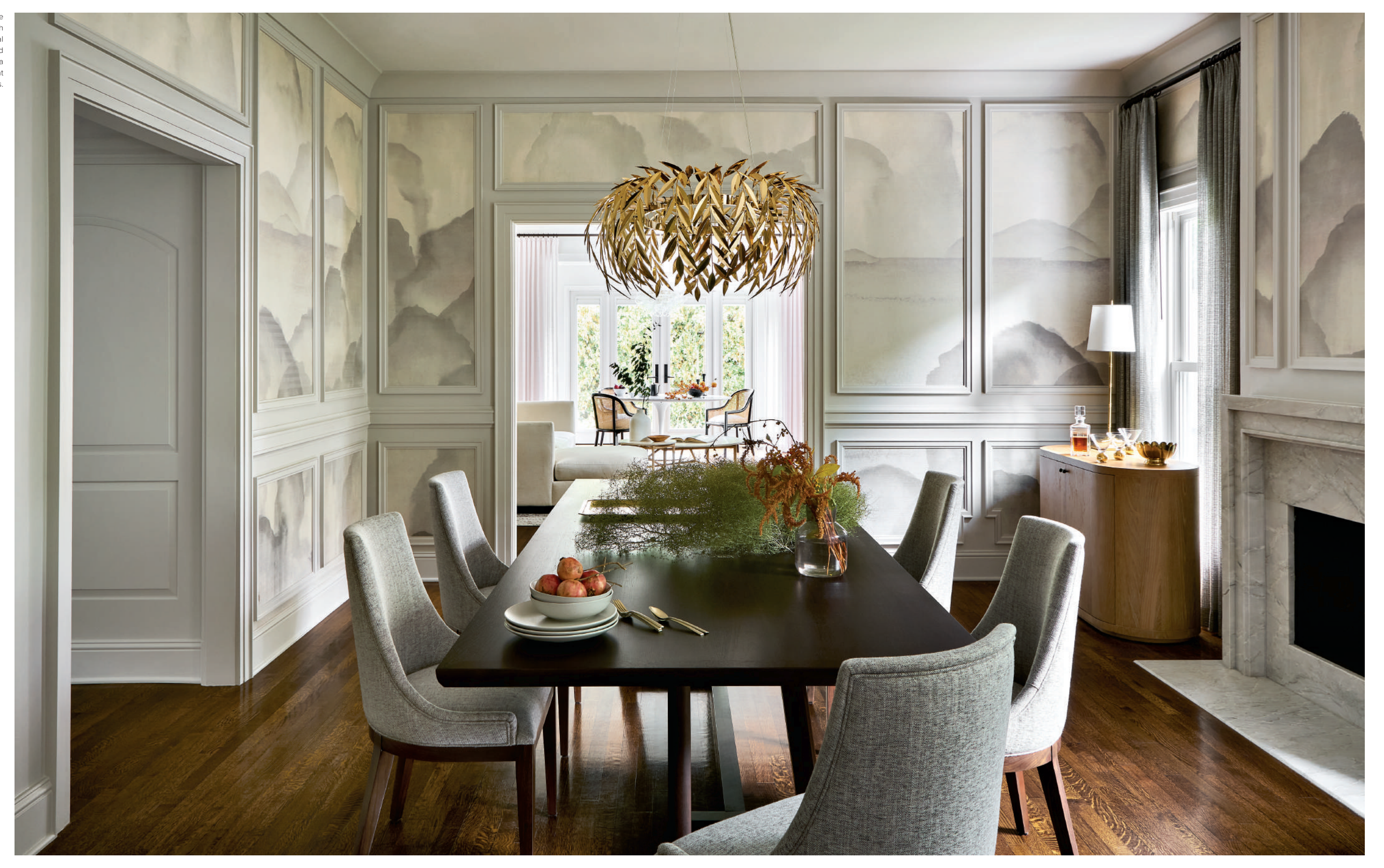
In the dining room, a serene Phillip Jeffries grass-cloth mural highlights the traditional wall panels. An InsidherLand chandelier hangs above the Altura Furniture table from The Bright Group and Ben Soleimani chairs.