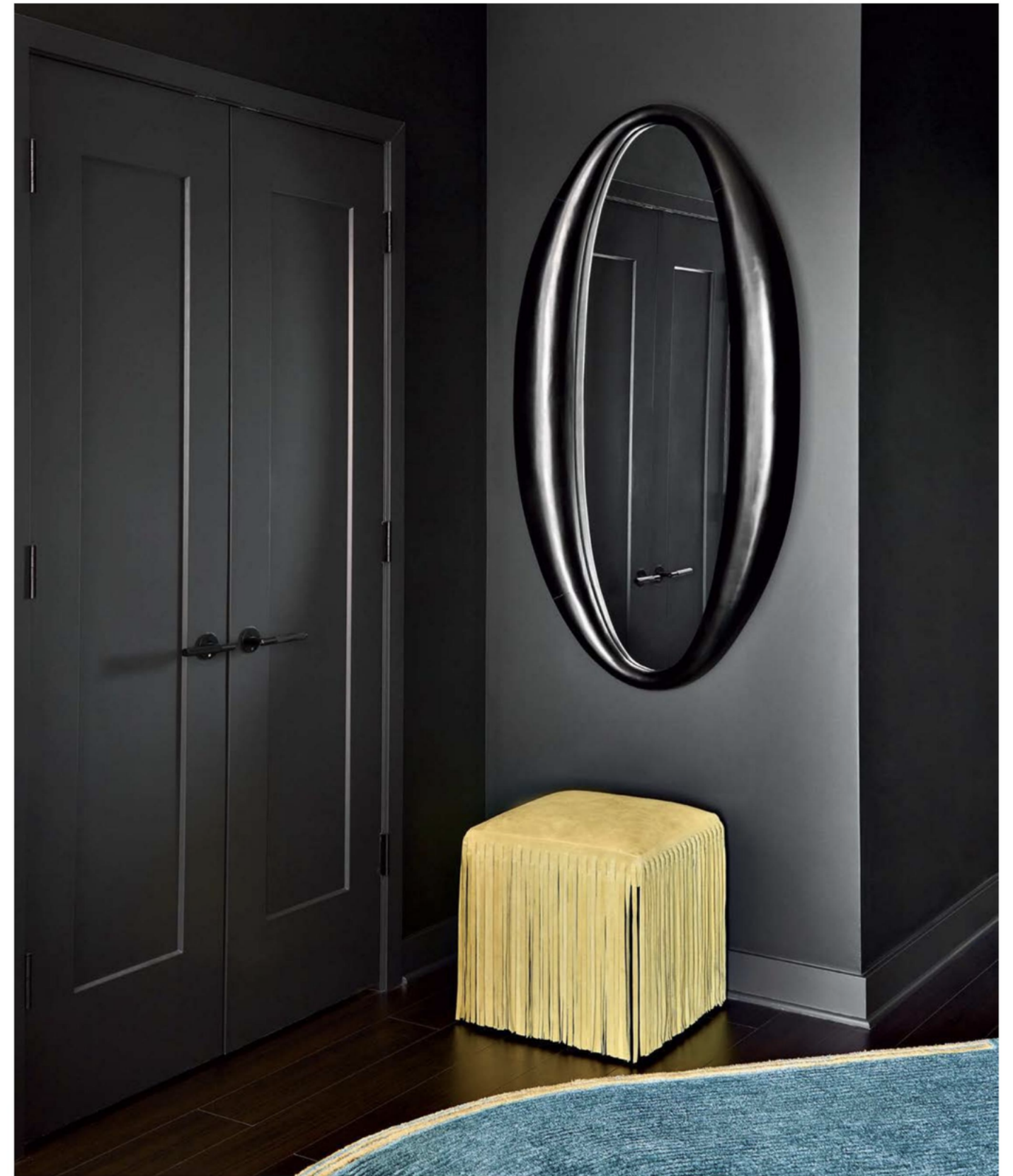
Bold shapes and hues underscore this avant-garde Chicago bachelor pad. Lacquered in Benjamin Moore's Blacktop, the foyer features an oblong Noir mirror and a CAI Designs stool accented with a jaunty suede fringe.