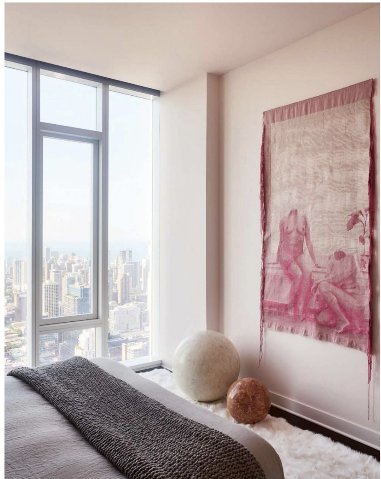
Opposite: The woven tapestry Returning your gaze by artist Mia Weiner hangs over two vintage tessellated marble globes in the main bedroom. A lush white Wiersma shag rug lies underfoot with "a 1970s vibe that I love," the client says.