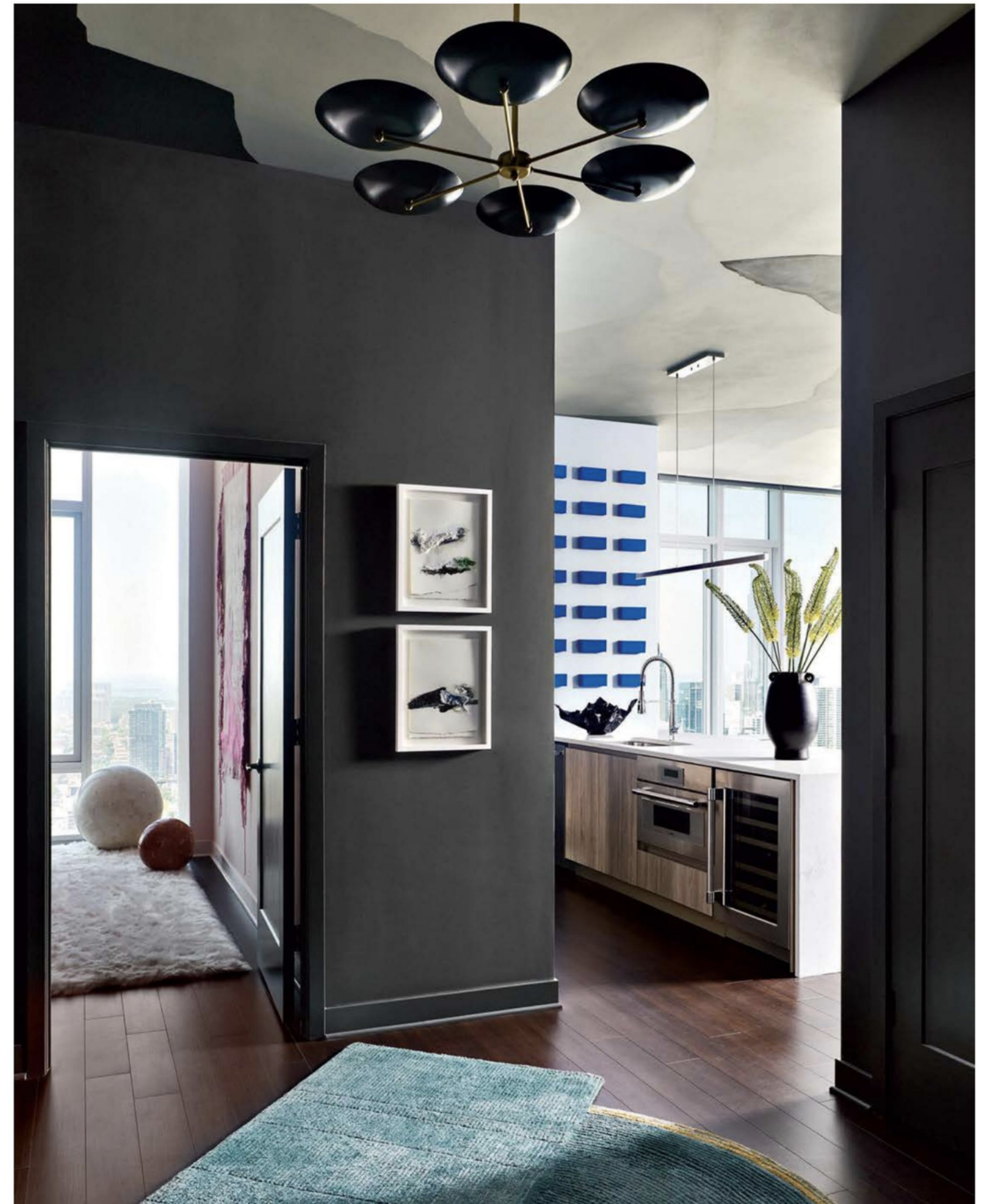
Opposite: Immediately upon entering the foyer, visitors are gifted with a peek into unexpected design moments grounded by a Jaipur Living rug. An Arteriors chandelier and framed mixed-media artworks by Dana De Ano punctuate the space.