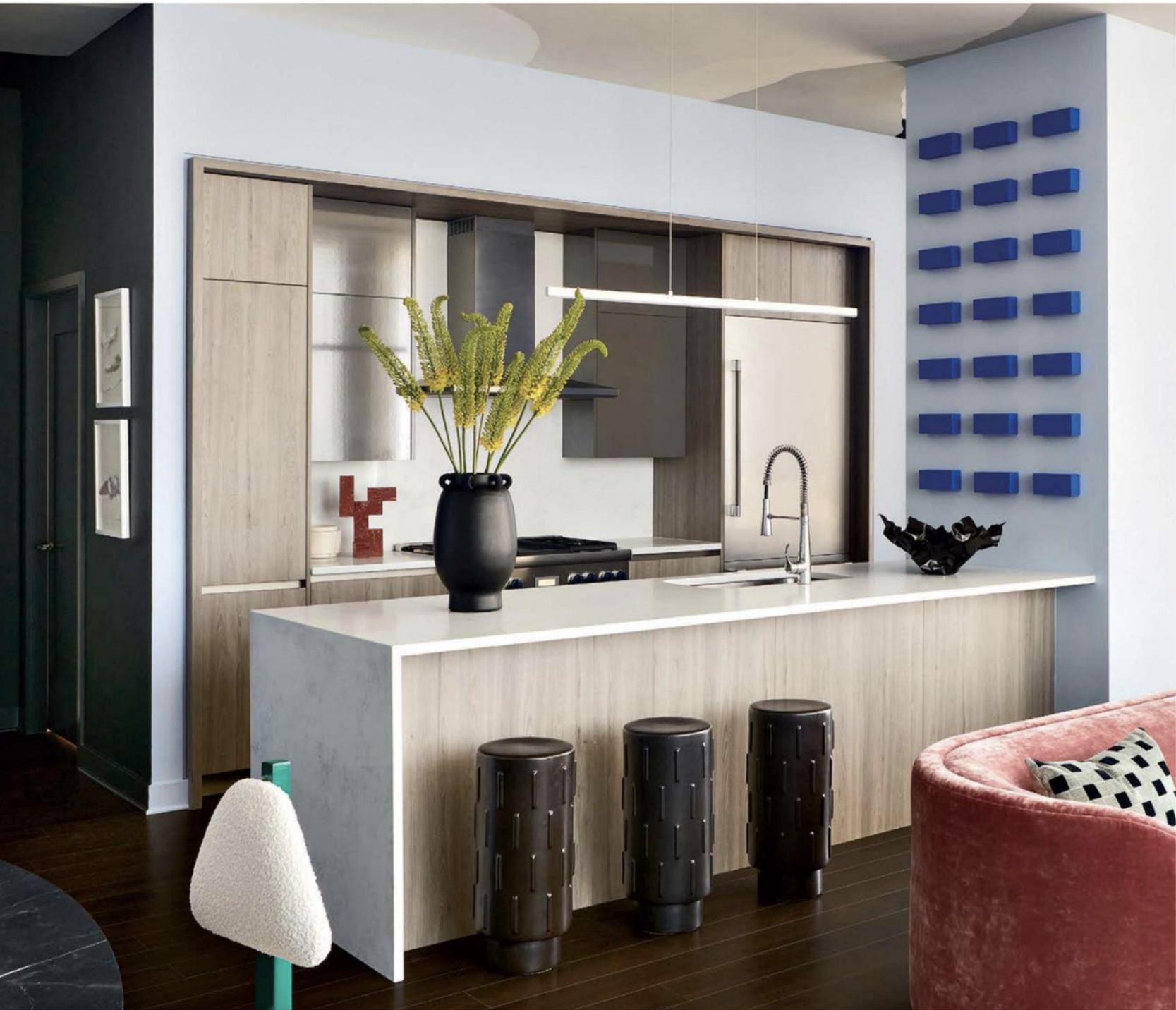
Above: Svenstrup elevated the already-sleek kitchen with glossy black barstools. Local artisan Brittany Sazonoff's custom block installation coated in Rosco's Supersaturated Ultramarine Blue infuses a sense of whimsy.