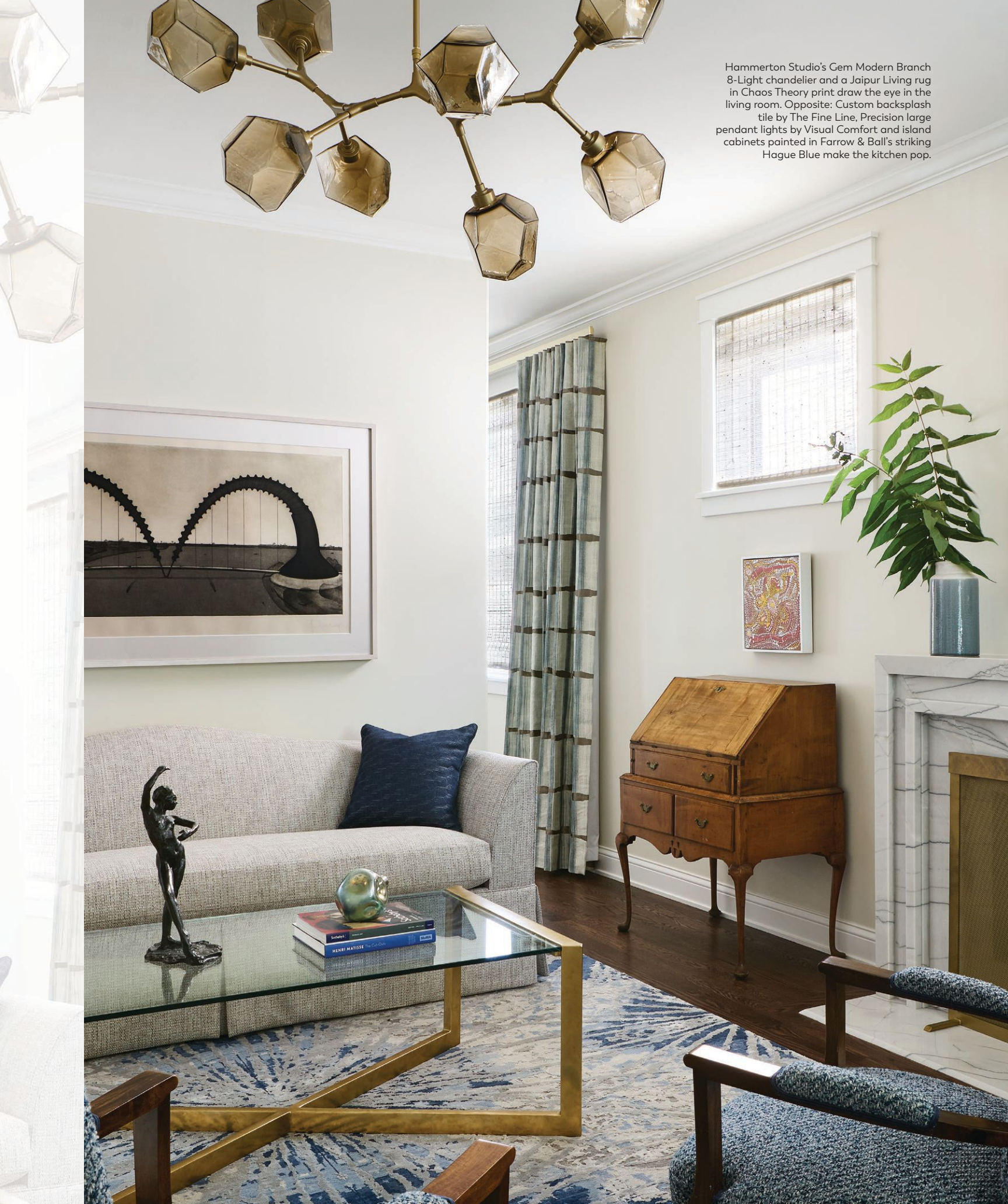
Hammerton Studio's Gem Modern Branch 8-Light chandelier and a Jaipur Living rug in Chaos Theory print draw the eye in the living room. Opposite: Custom backsplash tile by The Fine Line, Precision large pendant lights by Visual Comfort and island cabinets painted in Farrow & Ball's striking Hague Blue make the kitchen pop.