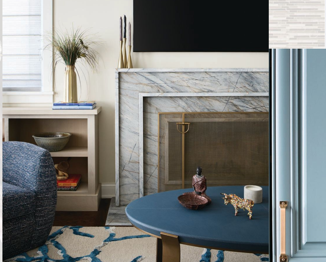
Clockwise from top: The living room coffee table boasts a custom Charleston Forge base and custom upholstered top by Kaufman Segal Design in Wolf-Gordon’s East Village Blue Ridge vinyl; the inviting lower-level wet bar features a handsome Bison Brick tile backsplash by The Fine Line and cabinets painted in Benjamin Moore’s Knoxville Grey; custom grasscloth wallpaper by Ashley Woodson Bailey in the Reese pattern adds a dose of drama to a powder room.

“I think it’s hard for the clients to believe it’s the same house once they step inside,” sums up Kaufman. “Both of their aesthetics and personalities are reflected throughout the house and there is a real sense of joy in being surrounded by and inhabit a space that echoes the family as a whole.” ■