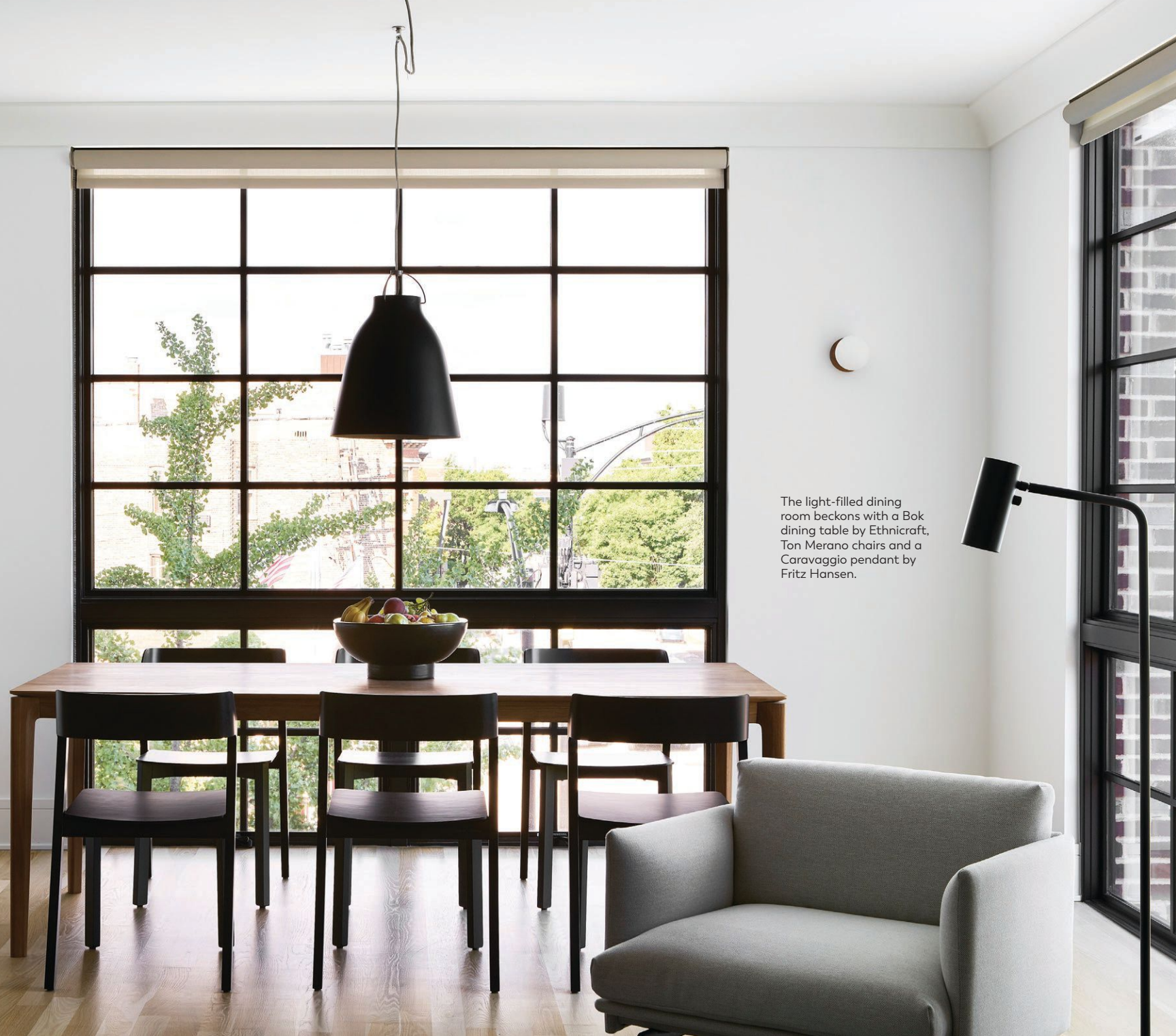
The light-filled dining room beckons with a Bok dining table by Ethnicraft, Ton Merano chairs and a Caravaggio pendant by Fritz Hansen.