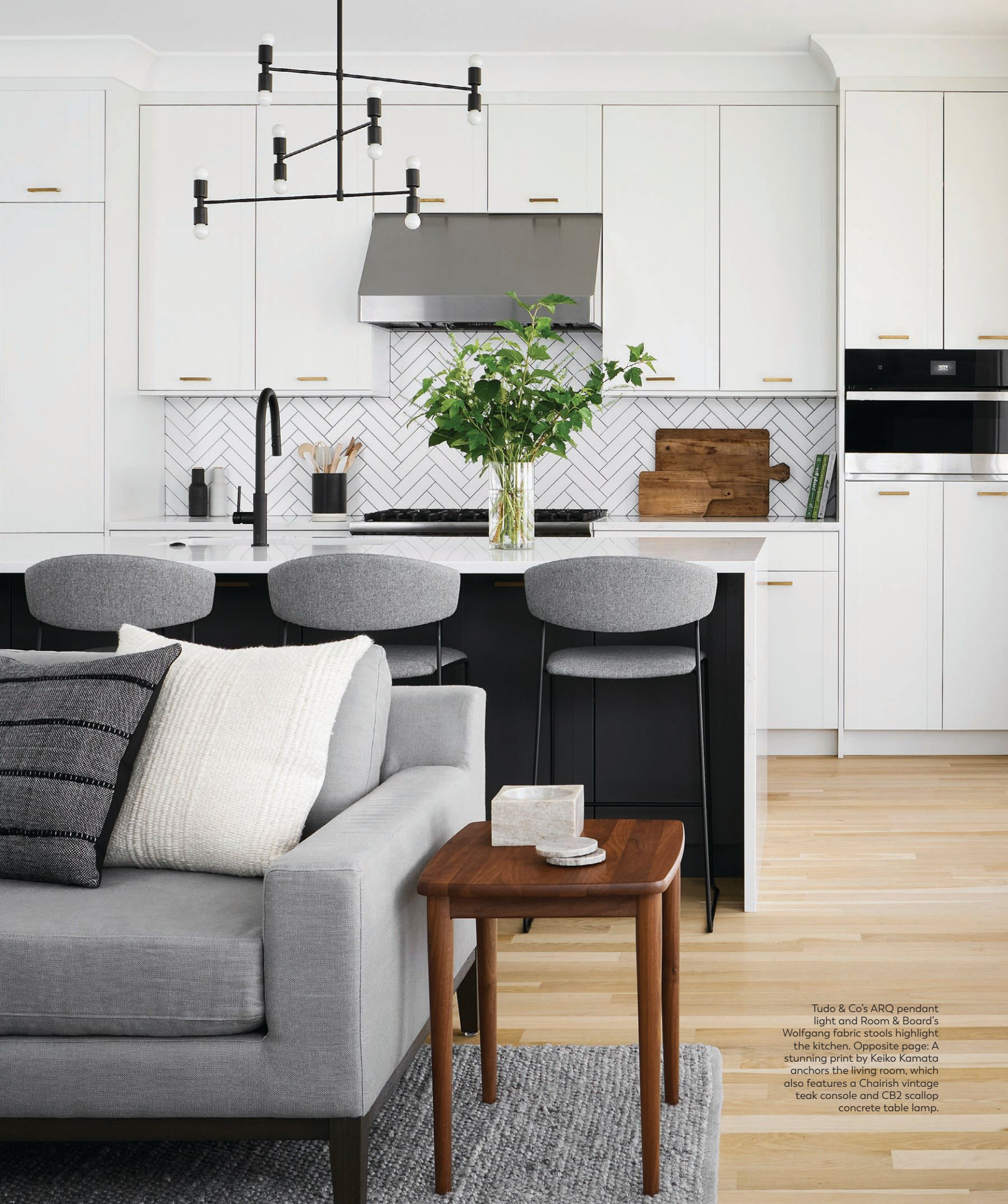
Tudo & Co's ARQ pendant light and Room & Board's Wolfgang fabric stools highlight the kitchen. Opposite page: A stunning print by Keiko Kamata anchors the living room, which also features a Chairish vintage teak console and CB2 scallop concrete table lamp.