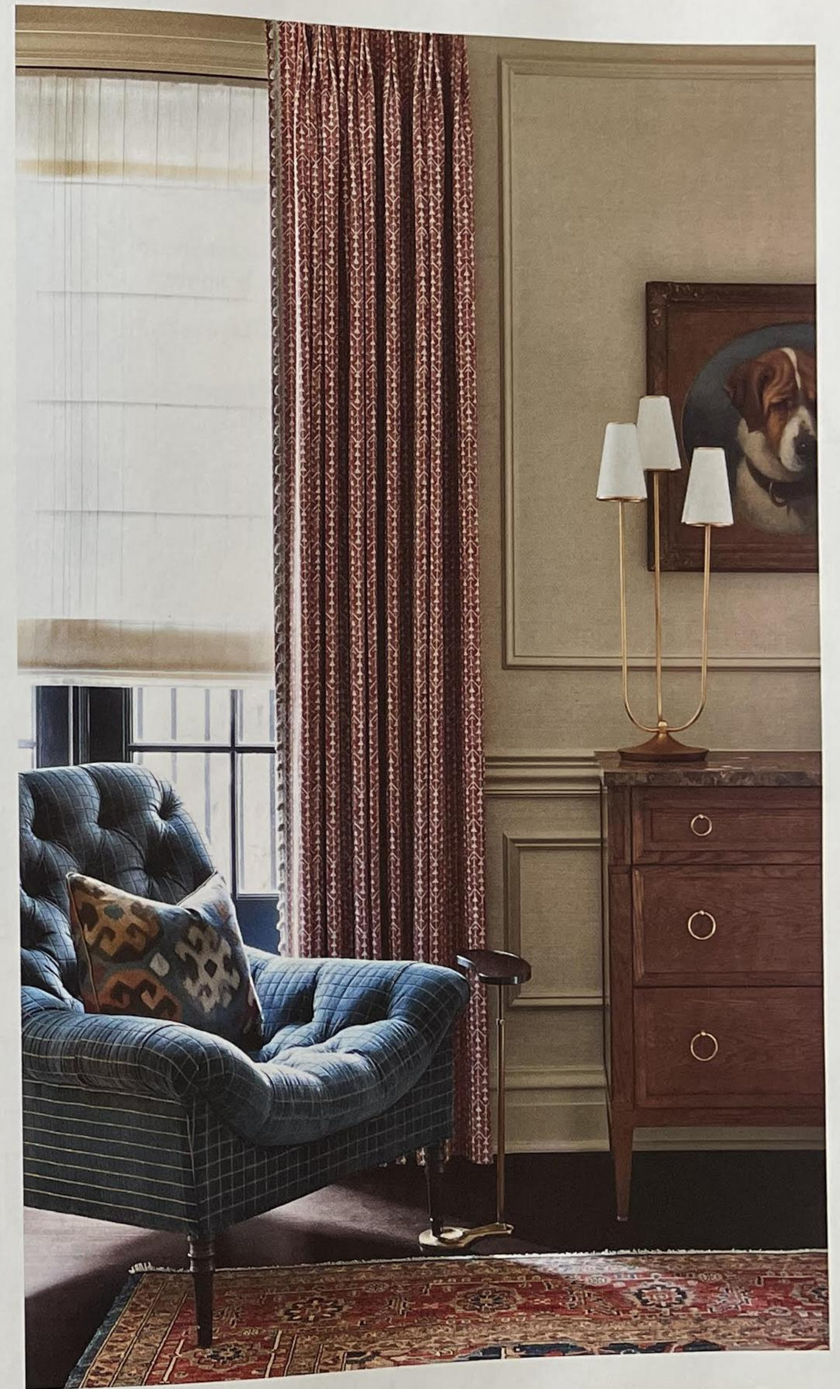
Opposite: Inspired by menswear, a Holland & Sherry wallcovering and a bed upholstered in a plaid fabric by the same brand give this guest bedroom a masculine air. A Roman shade in a Loro Piana textile hangs behind the Hickory Chair seat.