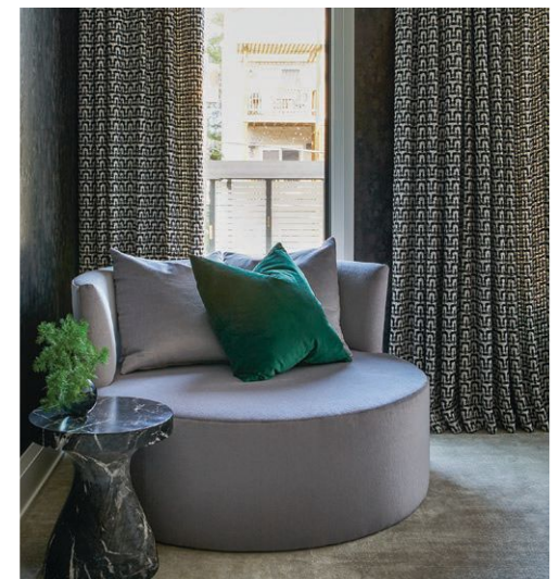
Clockwise from left: The girls' playroom is bright and cheery with Designers Guild wallpaper and all-pink accessories; for the primary bedroom, the couple requested "a moody vibe that felt like a complete escape"; textured window coverings from Couture Window Treatments add dimension.